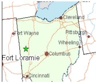
Fort Loramie, Ohio

Approximately 23.5% of Fort Loramie residents hold a Bachelors degree. In addition, 8.5% hold a Graduate or professional degree. The median household income is $67,269 (US Census Bureau, 2010). The unemployment rate is 6.5% and the