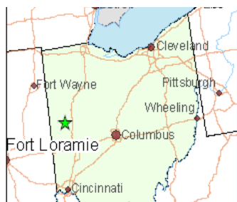
Fort Loramie, Ohio

Approximately 23.5% of Fort Loramie residents hold a Bachelors degree. In addition, 8.5% hold a Graduate or professional degree. The median household income is $67,269 (US Census Bureau, 2010). The unemployment rate is 6.5% and the